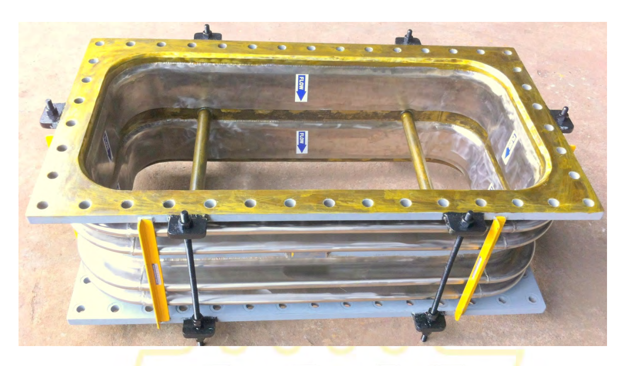
Non-metallic Expansion Joints :- (Rubber and Fabric)